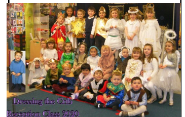
Dressing the Child Reception Class 2021